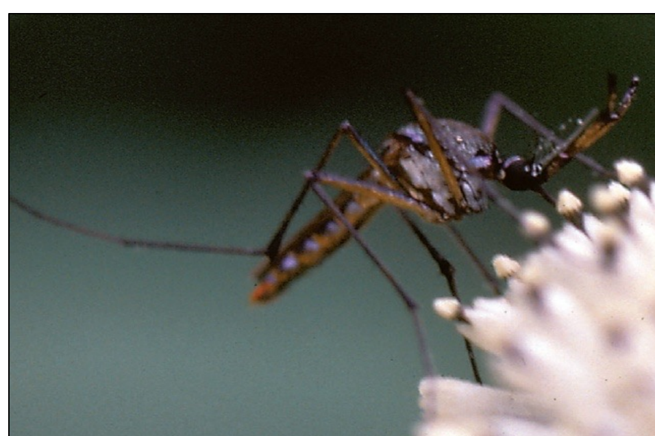
Adult Toxorhynchites haemorrhoidalis .