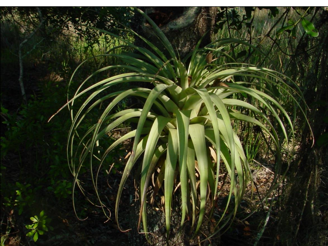
Giant Airplant, Tillandsia utriculata

Nadkarni NM and Matelson TJ. 1989. Bird use of epiphyte resources in Neotropical trees. The Condor. 91(4): 891-907.